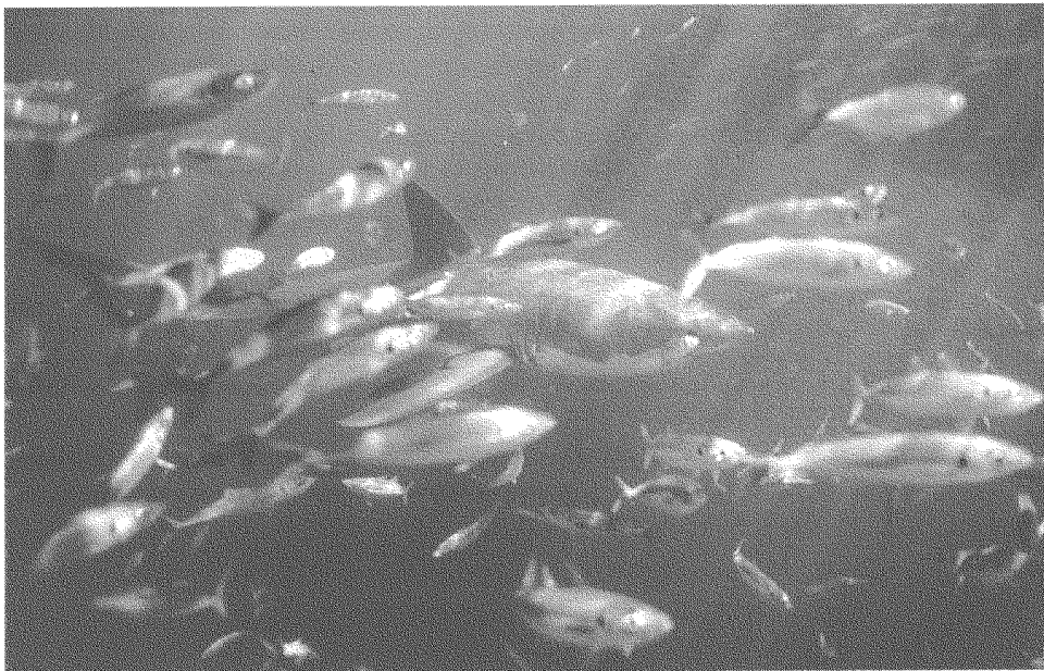
Fig. 2. An estimated 350-400-cm great white shark observes the possible prey remaining at the visibility limit behind the school of jack mackerels.

its approach. By applying this approach tactic, the smaller white sharks could be deciding whether to attack the cage immediately, or to further assess the viability of the possible prey item. The shark can continue to evaluate the parameters of the predatory event and remain, undetected, at the visibility limit behind the school of fish, swimming on an axis of shark / school of fish / prey. We have named this behaviour “hidden approach” (fig. 3).