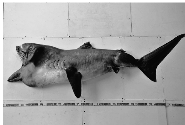
Fig. 1. The female Megachasma pelagios specimen (3,667 mm TL) captured from 700 km off Ibaraki Prefecture, Japan.

The present specimen (Fig. 1) was captured by the bonito purse seine fishing boat, Taishi-maru , from the western North Pacific 700 km off Ibaraki Prefecture, Japan in the Kuroshio